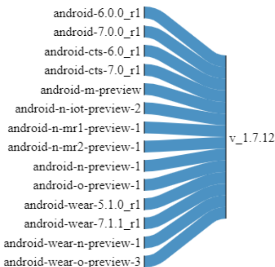
Fig. 2 A visualization result that shows how Android project uses slf4j versions

dated their own copy library. The visualization result shows that the first period of Android project used JUnit version 3.8.2. After the copy was updated to JUnit 4.10 and JUnit 4.12, the developers modified their own copy, as indicated by several colors of the links. Table 2 shows the actual values of aggregated file similarity between the visualized links. Android developers modified their copy of JUnit 4.10 for Android 4.2.1. The commit message says “Allow subclasses of JUnit38ClassRunner to create specialized filtered test suites.” The developers introduced a new feature to their own copy and the change decreased the aggregated file similarity. Another change has been performed for Android 5.0.0. Developers introduced their own (“android test runner”) package and reverted a modified file to the original version. The change increased the aggregated file similarity. The version has been updated again for Android-n-preview-3. Developers added generic type annotations to aid certain Java compilers. Android developers also used modified versions of JUnit 4.12. The change is related to Hamcrest library [14] that provides rich expressions for JUnit test cases. The first modified version was compiled against Hamcrest 1.1, and the second version was compiled against Hamcrest 2.0.